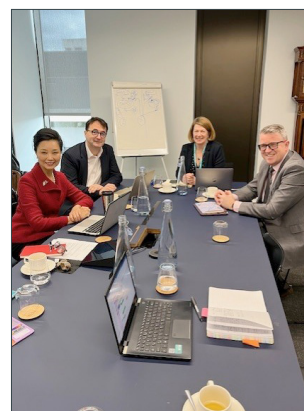
RESHAPING SURGICAL TRAINING

We are also aware of significant geographical variation in recruitment and consultant vacancies across the country. In response, we have engaged with Deans of Dental Schools in both the North and West of the UK, who have responded positively to supporting a shortened BDS programme for OMFS trainees – pending funding arrangements.