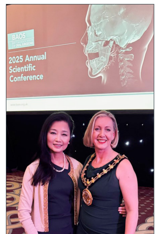
STRENGTHENING TIES WITH BAOS