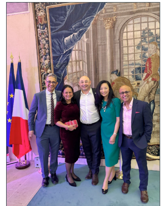
STRENGTHENING ANGLO-FRENCH TIES